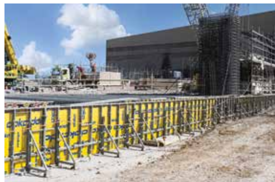
Even extended alignments do not require additional stiffening.